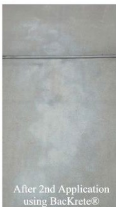
After 2nd Application using Backrete®