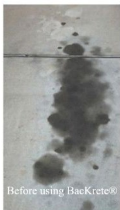
Before using Backrete®