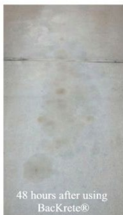
48 hours after using Backrete®